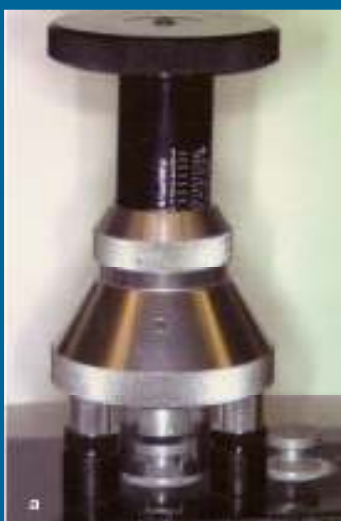
a) Testing apparatus for pull off strength c) Pull off strength results over wet concrete with BDC Vapor Seal

broke before Vapor Seal's adhesion did. The Pull-Off Adhesion was at an average of 800 psi before the actual concrete broke off.